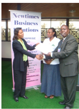
A Corporate CEO witnesses as the company HRM is awarded her course certificate. Another CEO receives her certificate as her GM looks on