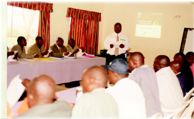
Skills development seminar